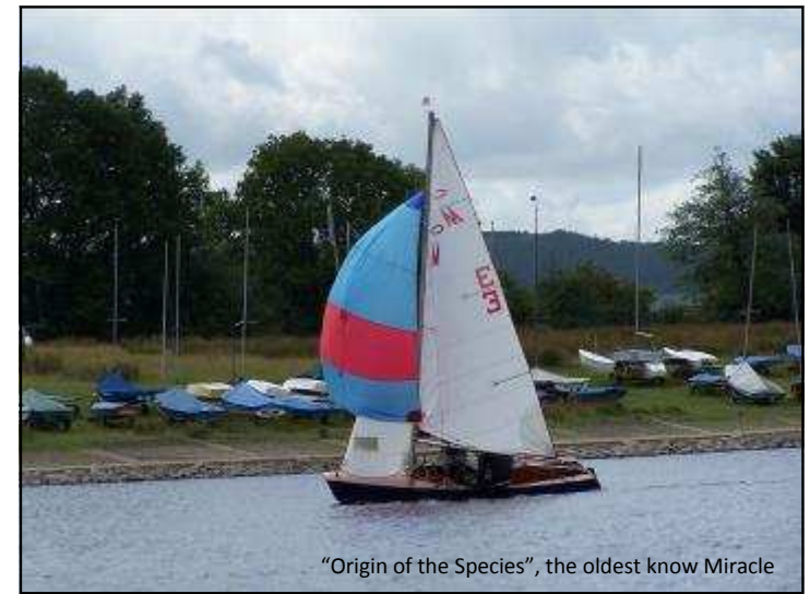
“Origin of the Species”, the oldest know Miracle